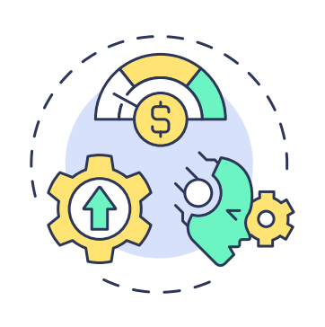
Lower Cost of Ownership